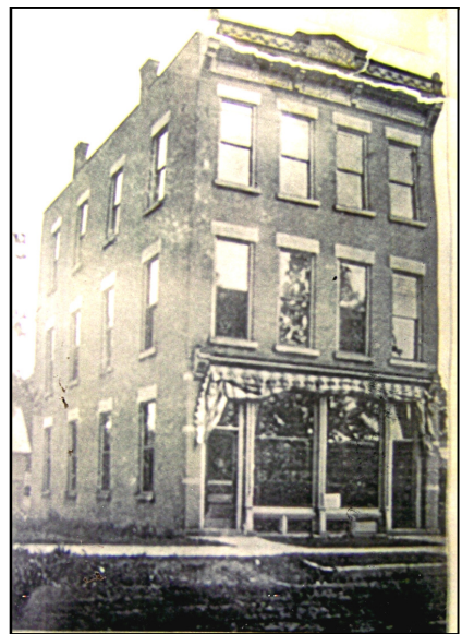
The Northville Bank on North Main Street.

The officials of the bank had to use a heavy board this morning in order to pry the inner doors. They also had great difficulty in opening the inner money vault as the combination worked very hard but they were finally successful and found its contents intact.