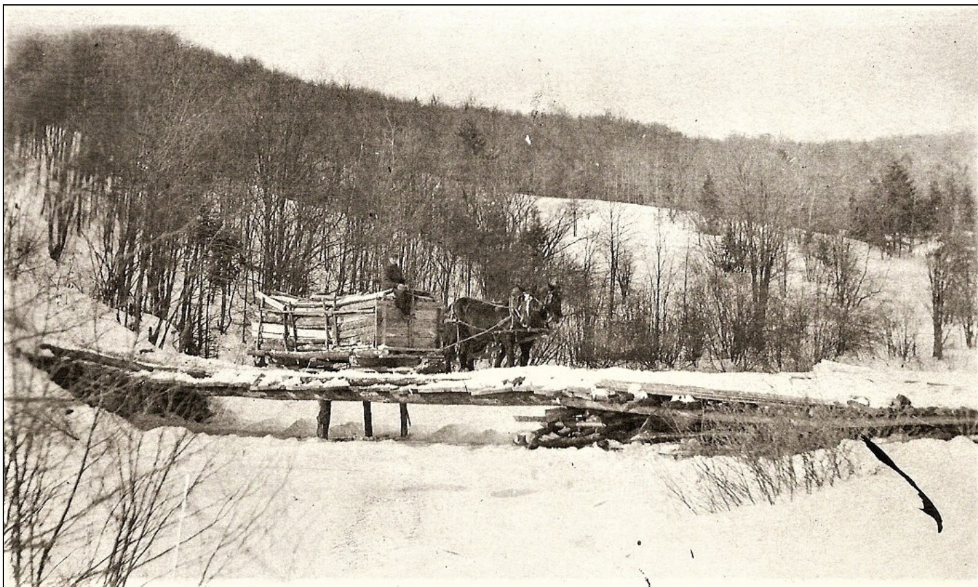
A load of hemlock bark on it's way to the Tannery. This picture is a local picture . There was a Tannery in Hope Falls , so it's very likely this was on it's way Hope Falls.