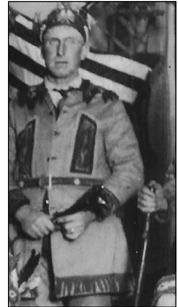
CITIZENS UP IN ARMS 1911

People of Northville Are Opposed to Conklingville Dam Project. Amsterdam, N. Y., May 13. — The members of the state water supply commission visited Northville yesterday. The commissioners inspected the property surrounding Northville, which will be affected by the Conklingville dam project. The citizens of Northville are opposed to the project. The water will practically surround Northville at a depth of eight feet. The dam will contain thirty-two billion cubic feet of water and will flow in dry time for a period of 80 days, a greater volume of water than flows in the Hudson river, at low water. It is expected that the commission will make its report at once and that a bill will be presented to the legislature with a view to the enactment into law so that the construction of the dam can proceed.