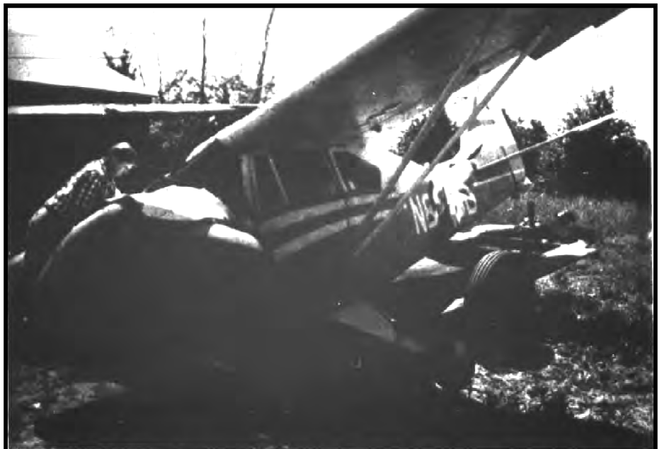
FOUR PERSONS WERE INJURED Saturday morning when this light airplane crashed shortly after takeoff from the Red Barn Airport on the Mayfield Northville Road.