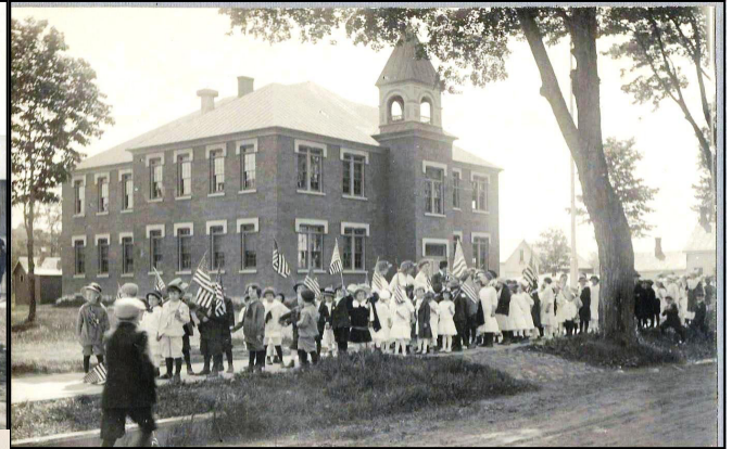
Children lining up at the old school, to march in the Memorial Day Parade . Each received a flag to carry.