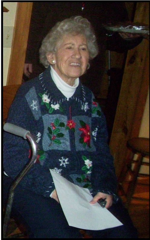
Picture at a NNHS Christmas Party 2014