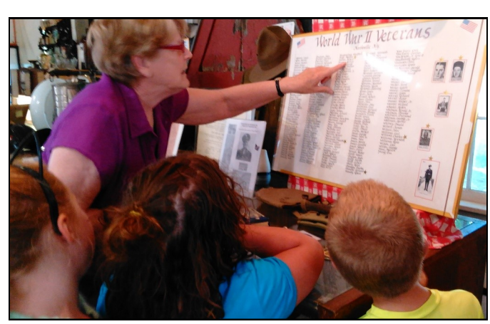
Gloria Fulmer showing the kids the name of a WW II veteran in their family