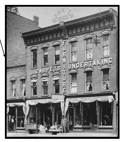
Heath Block on Main Street