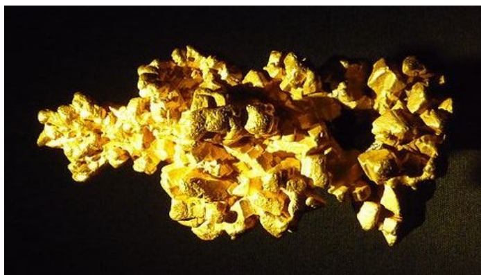
A Gold Nugget

The claim letter to the State of NY (Pg 3) mentioned it was located on Stephen Ayers farm which was occupied by Lewis Miller. The Northern claim border was about 412 ft North of the pit, and the Southern border was about 1073 ft South of the pit. The claim bordered the Public Highway (Skiff road to Fishhouse) on the East side. It bordered the lands of Van Dyke and Cole on the South. The map on the right is an 1868 map, a later map might show who owned land in 1881. Machinery was moved into Corey flats later. There are Corey properties at the bottom of this map.