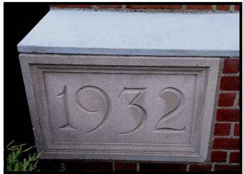
Corner Stone on the left hand corner of the auditorium wing

PROMOTE AS AN OBJECT OF PRIMARY IMPORTANCE, INSTITUTIONS FOR THE GENERAL DIFFUSION OF KNOWLEDGE. IN PROPORTION AS THE STRUCTURE OF A GOVERNMENT GIVES FORCE TO PUBLIC OPINION IT SHOULD BE ENLIGHTENED... WASHINGTON