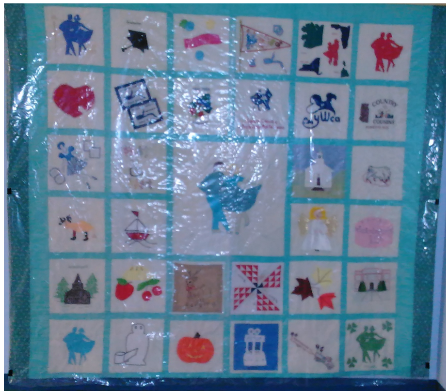
There is plastic over the quilt to prevent finger marks on the quilt