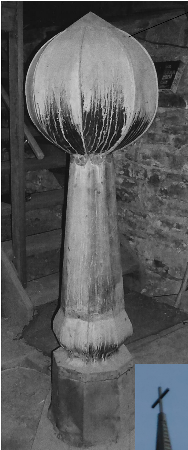
United Methodist Church

Take a guess...what is it? Where was it? Right now it's in the NNHS Schoolhouse Museum.