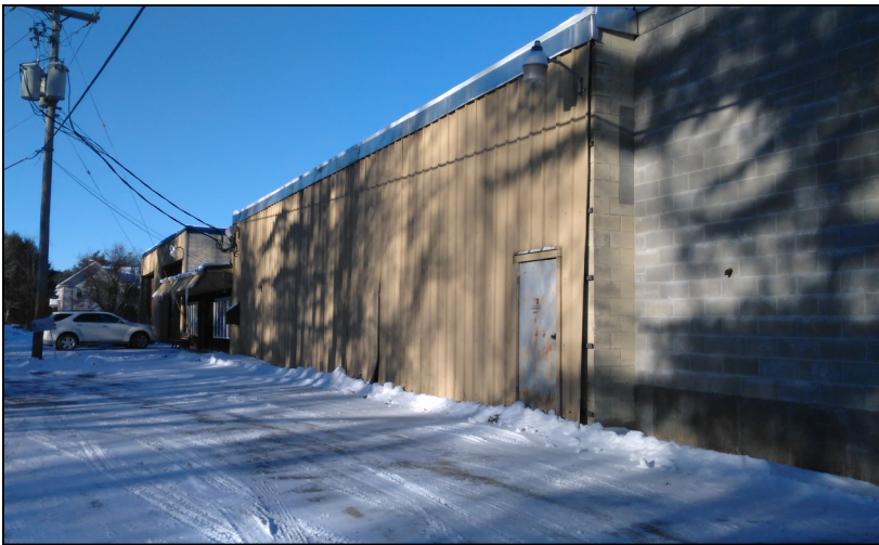
The former furniture factory as it looks today (2017)