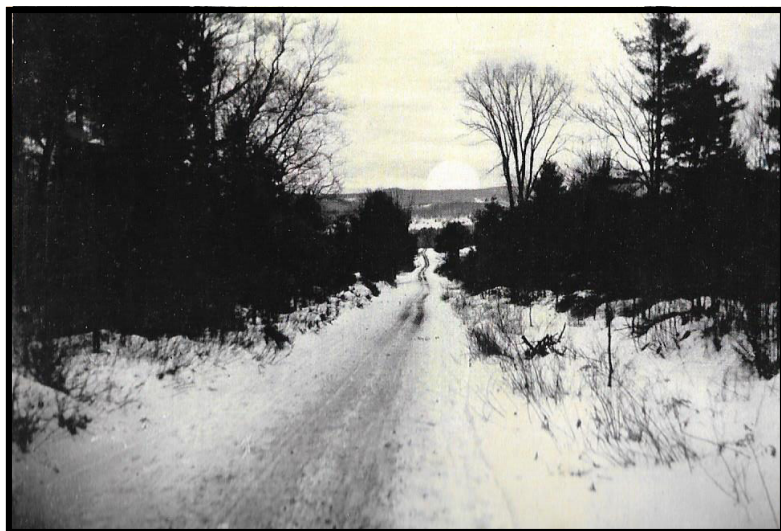
Gould Hill many years ago

Did you know that Macadam roads were so named because John Loudon McAdam pioneered the construction of a new method for paving roads? This method mixed heavy oil with stone which was spread on the road hot. When it cooled it was very durable.