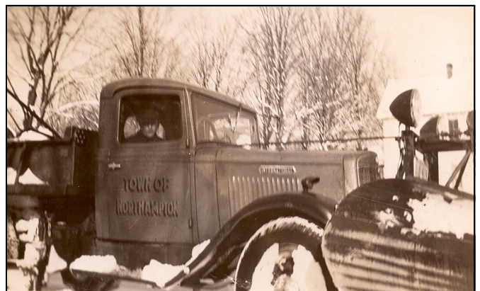
Town of Northampton plow circa 1945

The wooden tank of the sprinkler wagon was filled by an overhead hose, . At the retirement of Schoolcraft, George Groff took over the operation. Soon after that, because of the increase of homes in the village, and the increase use of water in each home, the village fathers became concerned of a possible water shortage, and began to frown on the use of large amounts for street sprinkling. In addition, the gradual paving of the streets of the village made the use of the sprinkler nugatory, and the village sprinkler wagon became a relic of a by-gone day.