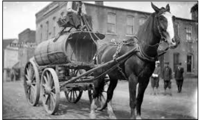
Example of a Horse drawn road sprinkler

Some of the streets, he would sprinkle only in front of paying customers. The benefits of the wetting was very short-lived, as the dirt streets would soon dry out.