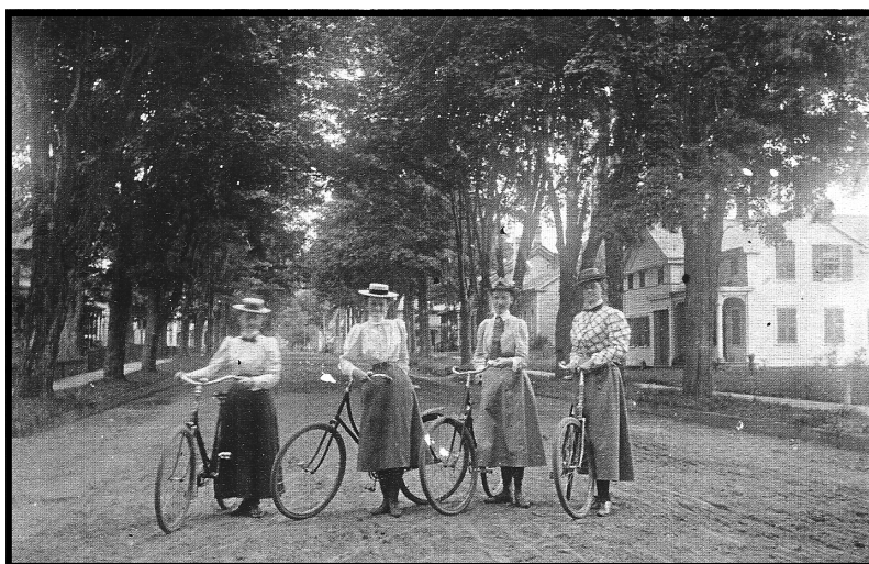
Here is South Main Street as a dirt street in 1898