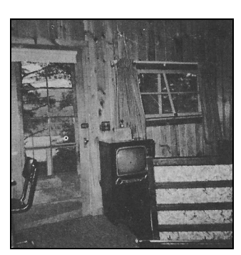
Notice old TV