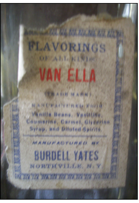
Ingredients: Vanilla Beans, Vanitine, coumstine, Carmel, Glycerine Syrup and Diluted Spirits.