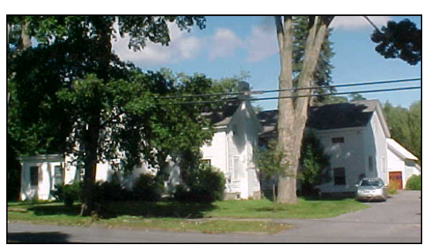
Yates house and business, South Main Street